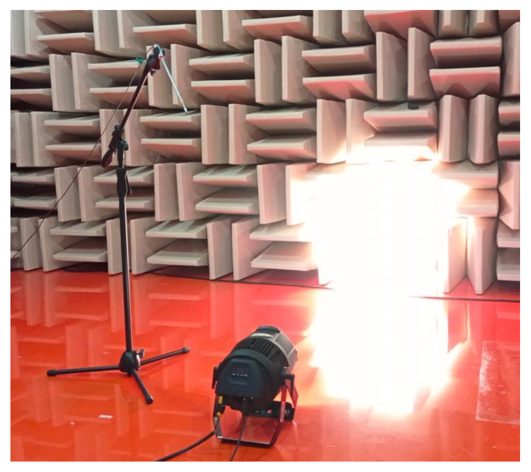
Figure 1: Test setup

The product was placed indoors in a semi-anechoic room in the internal Lab of Harman Technology in Shenzhen, China (See Figure 1). The ceiling and walls were all acoustically absorbent, and the floor was reflective. The main dimensions of the room were 5.9m * 4.9m * 3.3m (length * width * height).