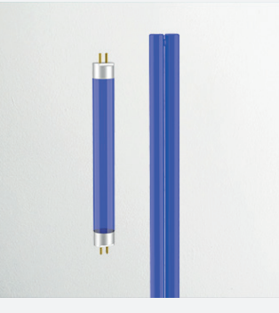
High quality lamp