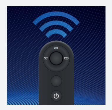
Remote control Through the wall

A motion sensor will detect any movement within 5 meters and immediately deactivate the lamp and sound an alarm.