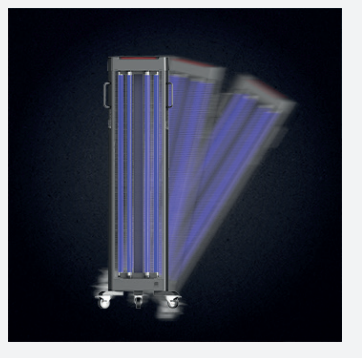
Fall protection -Auto Power Off When lamp detects a movement of more than 45°, it will automatically power off, thus preventing heat damage to surrounding objects, should the lamp fall over.

2 minutes delayed start with audible alarms. Once the disinfection time is set, the lamp will be turned on after a delay of 2 minutes allowing people and pets to leave the room.