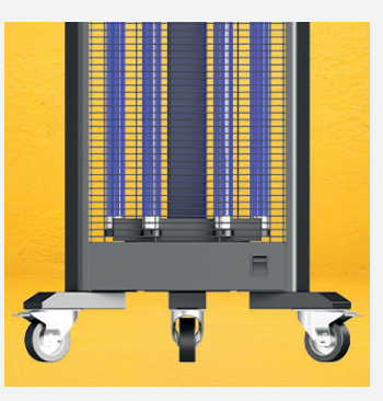
Integrated wheels Allows fast and easy relocation of unit

Note: Only when used in accordance with manufacturer instructions