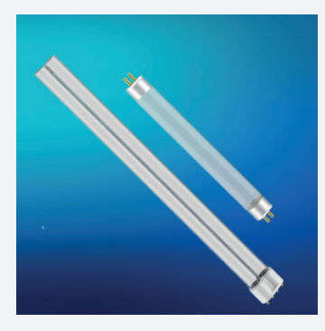
Quartz glass tube Allows full transmission of ultraviolet light