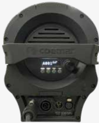
Otello 8 HD + (manual zoom) Rear Panel with the new OLED display