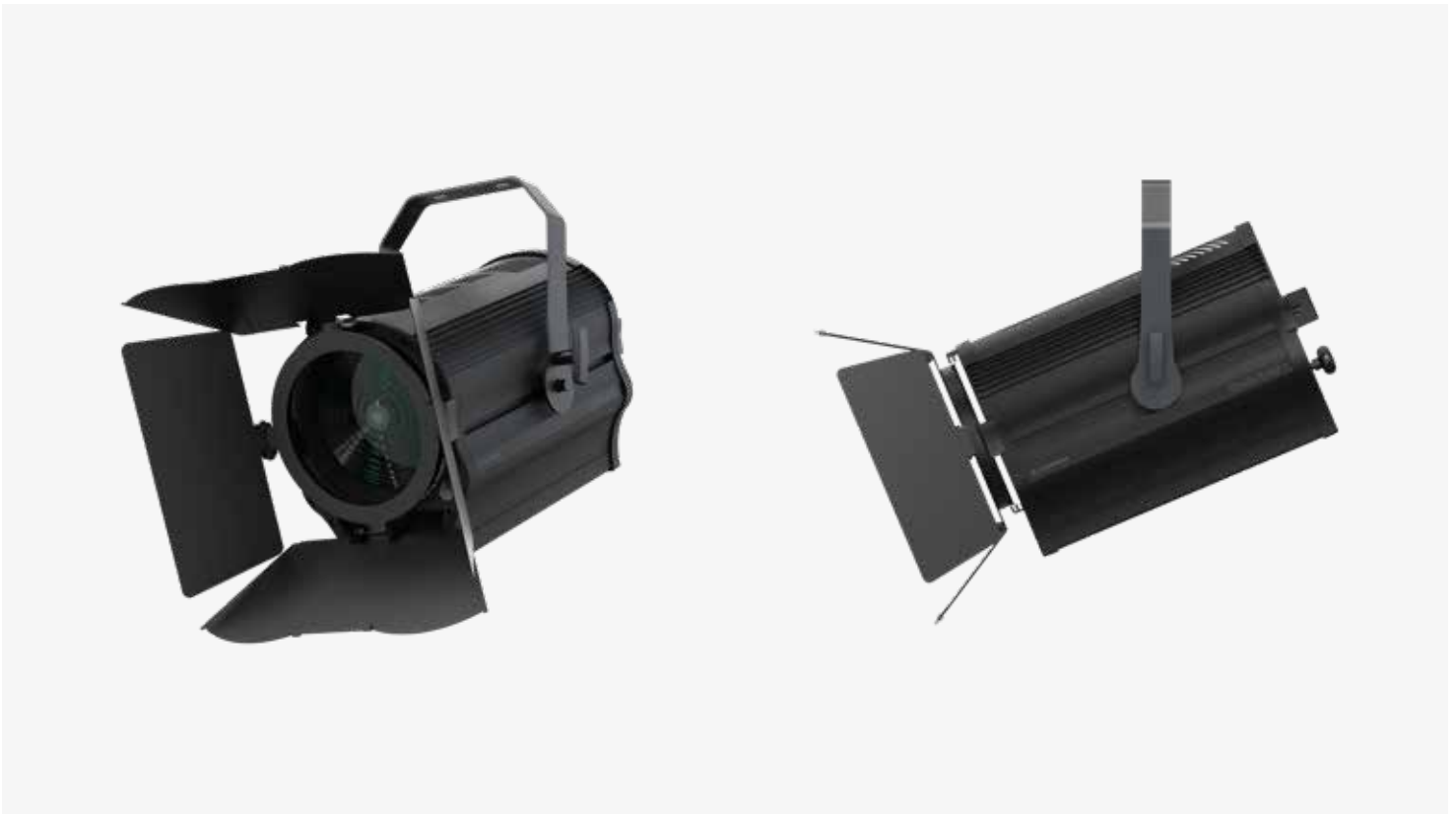
Otello 8 HD + with 8 leaf barndoor