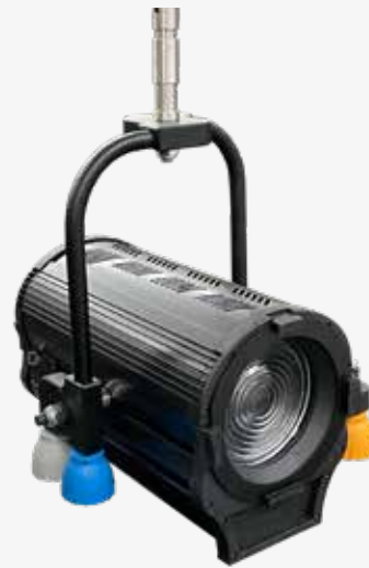
Otello 8 HD + with Pole Operated Yoke and Pole Operated Zoom