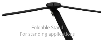
Foldable Stand For standing applications