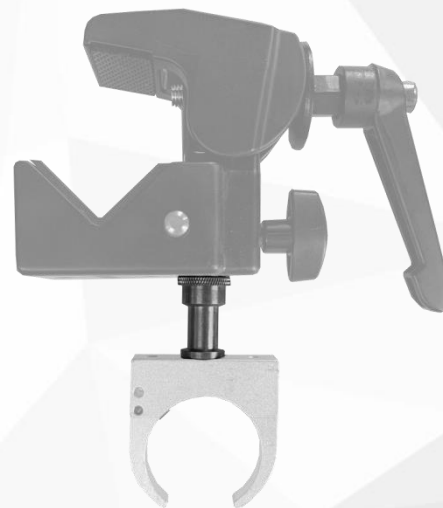
Babypin connecting AX1 holder to a Manfrotto Superclamp